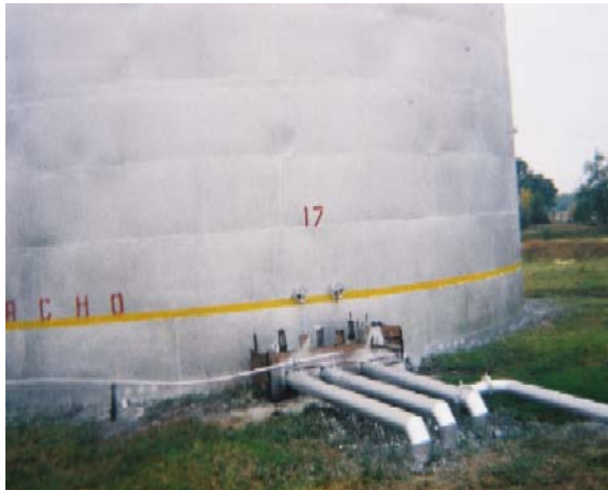
Picture 3: Flat bottomed tank with loamy ground and earth walls secondary containment

In the opinion of the operator, the tanks are not protected against washing away; a proof for this could not be given.