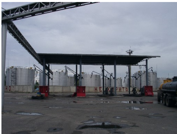
Picture 1: Tank-truck filling, in the background storage tanks without functional secondary containments

The warehouse, together with its transhipment facilities has the size of 35 ha and is situated in the outskirts of a big city, in a seismic zone. These facilities are located about 3-4 km away from the harbour and the transhipment facility, for loading and unloading the ships.